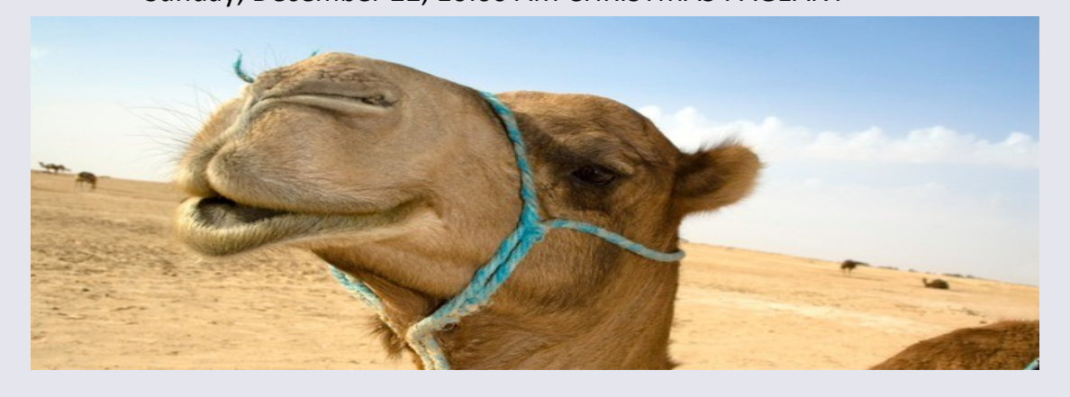
"It is good to give God thanks and praise"

Sunday, December 15, after church in the sanctuary – part assignments. Saturday, December 21 10:00 to 11:00 AM – Pageant rehearsal and costume distribution Sunday, December 22, 10:00 AM CHRISTMAS PAGEANT